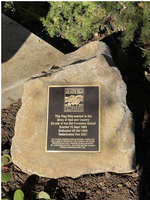
The new plaque and its mounting stone are near the base of the flagpole.