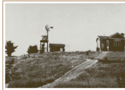
Los Altos Hills Historical Society

St. Luke's Chapel in the Hills has been designated Historical Site #10 by the Town of Los Altos Hills.